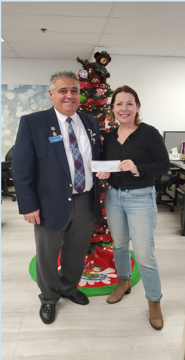
Cheque presentation to MFRC