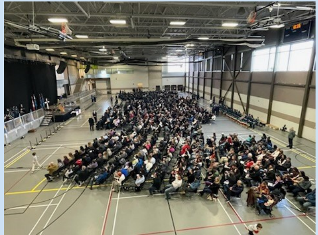
We get bigger and better every year!