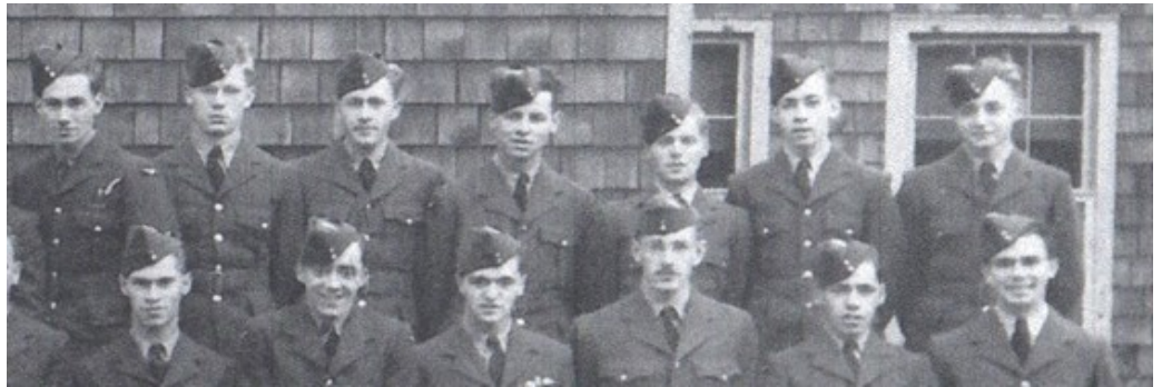
Technical Training School in Aylmer,