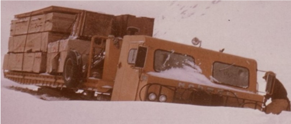
Snow machine on top of a glacier