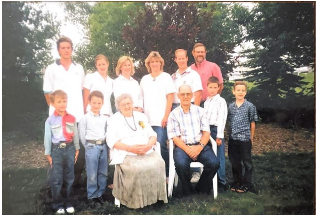
Family Portrait 2006