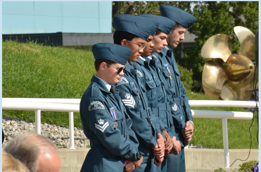
Some of the cadets present