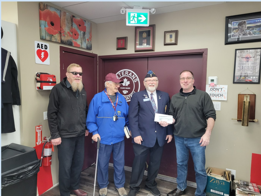
December cheque presentation to the Veterans' Food Bank