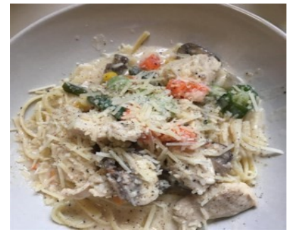
Easy Chicken Alfredo