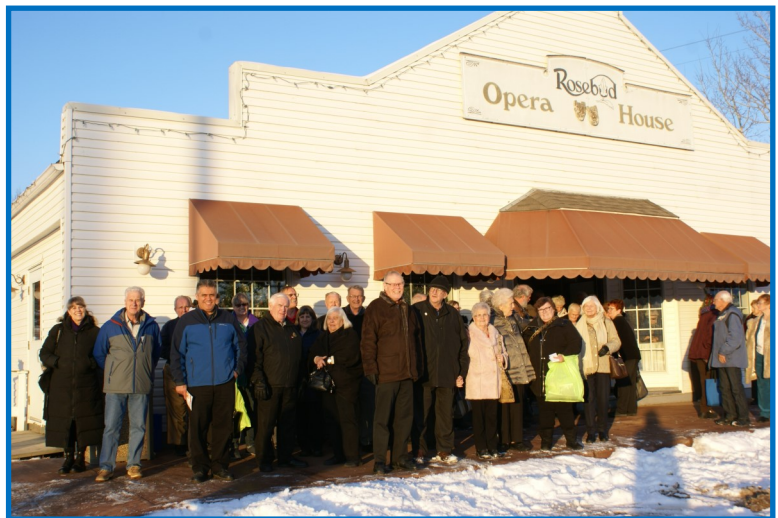
Annual trip to Rosebud Theater.. Always fun.