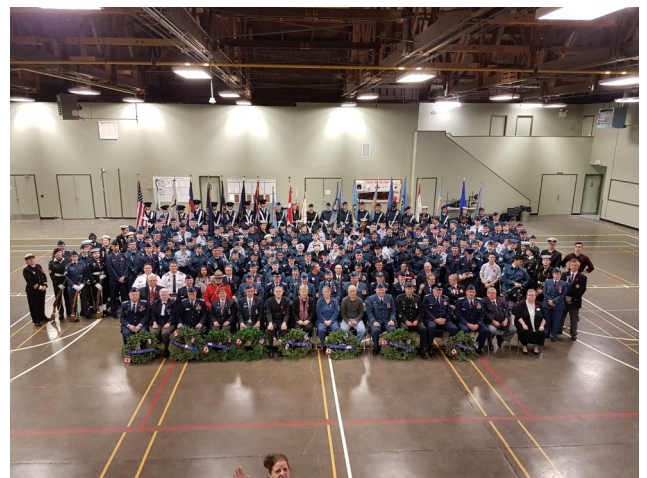
HART Ceremony in Lethbridge Congratulation to 702 Wing For a job well done