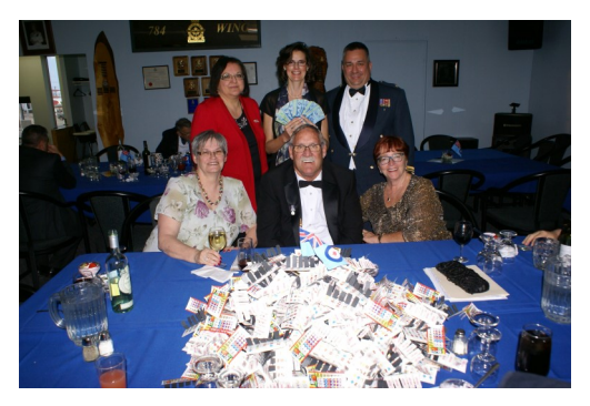
Our "group" supporting Cold Lake Wing by purchasing a mountain of pull tabs....and winning $250.00.