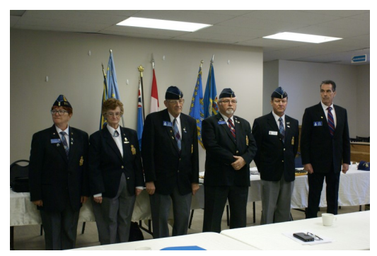
A picture of the new Alberta Group Executive