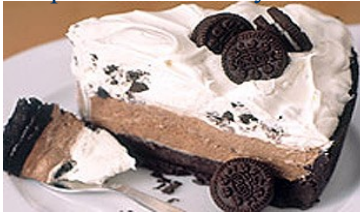
Triple-Chocolate Layer Pie