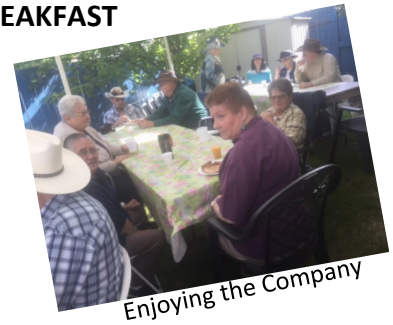
Enjoying the Company