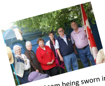
Part of our team being sworn in.