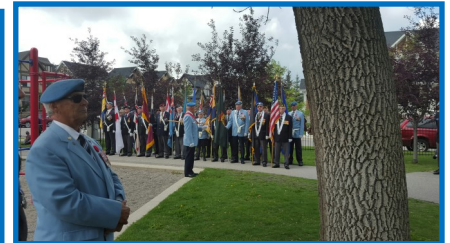
Flag party at Buffalo Park

Members of Canada's Armed Forces came to Peacekeepers Park to pay tribute to fallen comrades on Sunday 8th August.