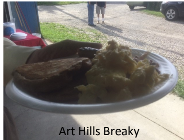
Art Hills Breaky