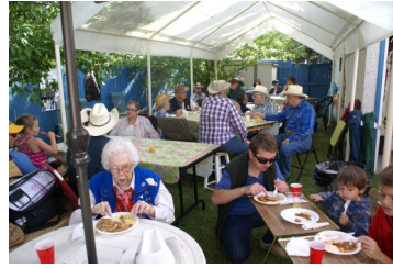
Enjoying the food