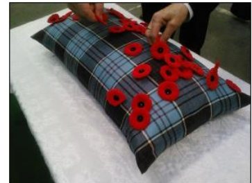
Remembrance Pillow – Photo by Irénée Rutema

The dedications and speeches at Mewata Armouries were extremely moving this year. . The increased security did nothing to keep crowds away. In fact, there were more than ever.