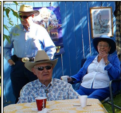
Enjoying Pancakes and Sunshine