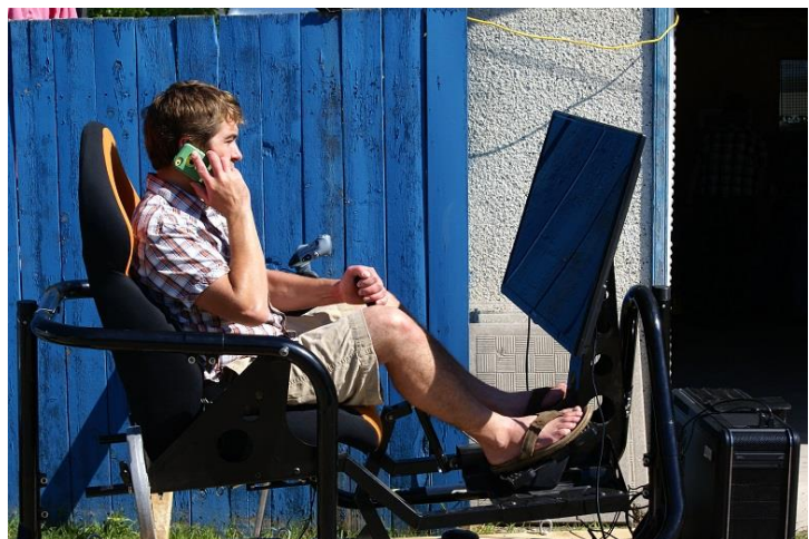
The DreamFlier does a Fly-Past! (Bev's Neighbour – Talking to the Tower?)