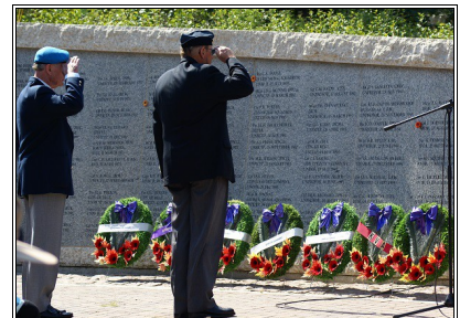
783 Wing Members at the Peacekeepers Parade