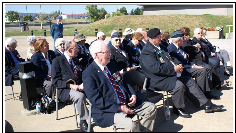
Members 783 Calgary Wing RCAFA