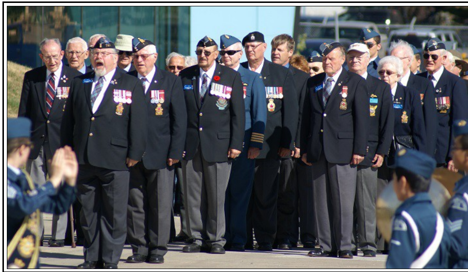
Veterans Lead the Parade