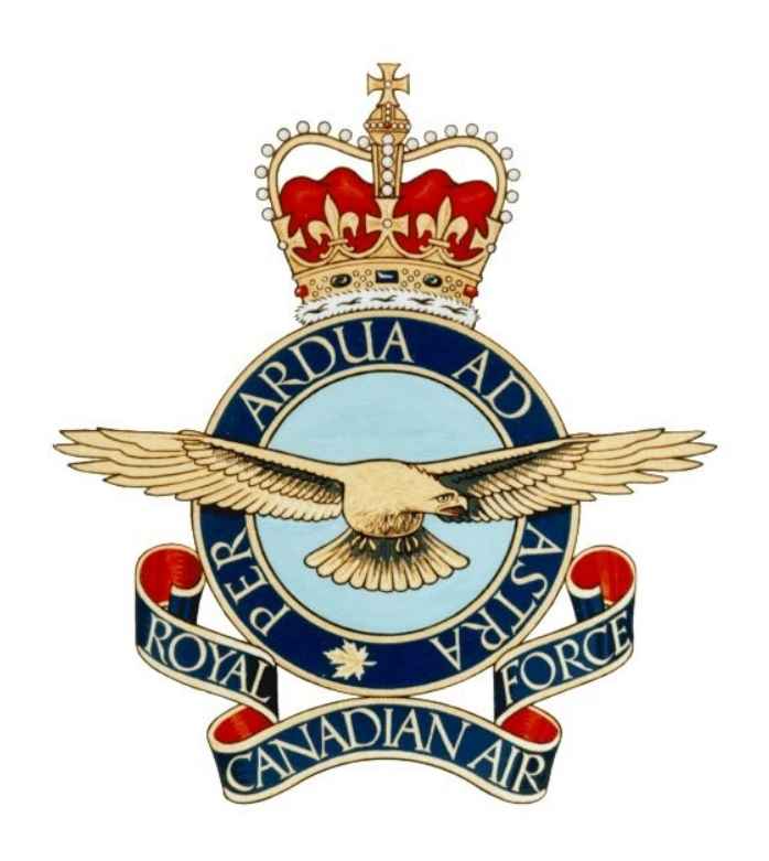
783 (CALGARY) WING March 2013 NEWSLETTER