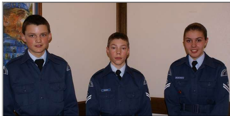
Winners of the Effective Speaking Competition South