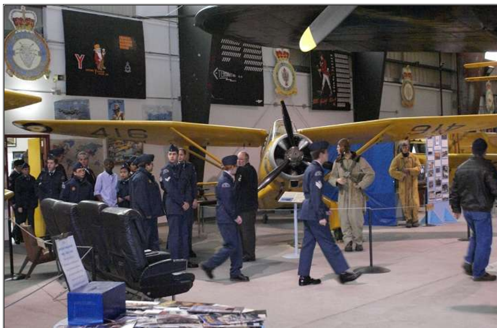
52 Squadron Cadets at Comber Command, Namaton (Mar 2)