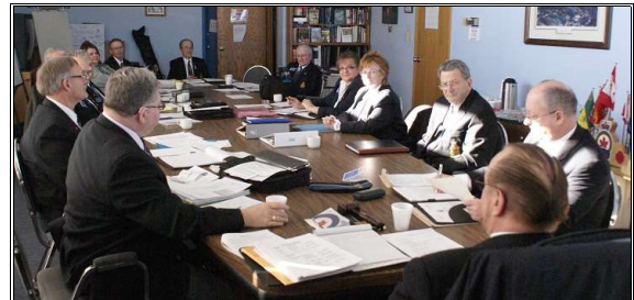
Alberta RCAFA at work in Red Deer (Feb 10)