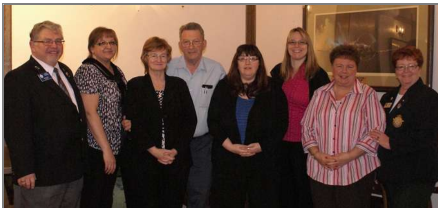
The Judges and Work Party for the Effective Speaking Competition South