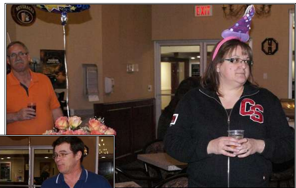
Surprise Party in Red Deer