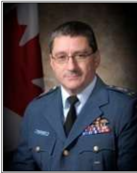
Lieutenant-General André Deschamps

On Feb. 27, 2012, the Commander of the Royal Canadian Air Force, Lieutenant-General André Deschamps, appeared before the Senate Committee on National Security and Defence to update committee members on the missions, activities and future plans of the Royal Canadian Air Force. Here is the text of his formal remarks.