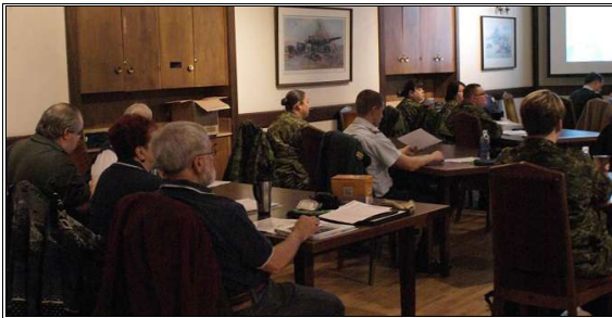
PR Seminar at Mewata DND (Feb 17)