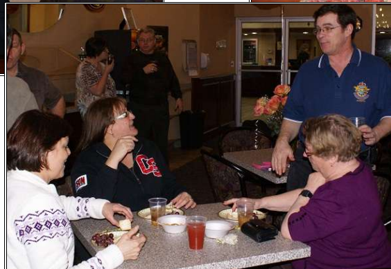
Night before Selection Boards (Feb 24)