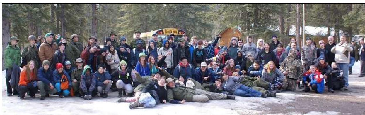
FTX for Airdrie 88 and Drayton Valley at Camp Worthington (Mar 17)