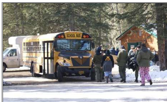
Brian Lewis's Bus at Camp Worthington (Mar 17)