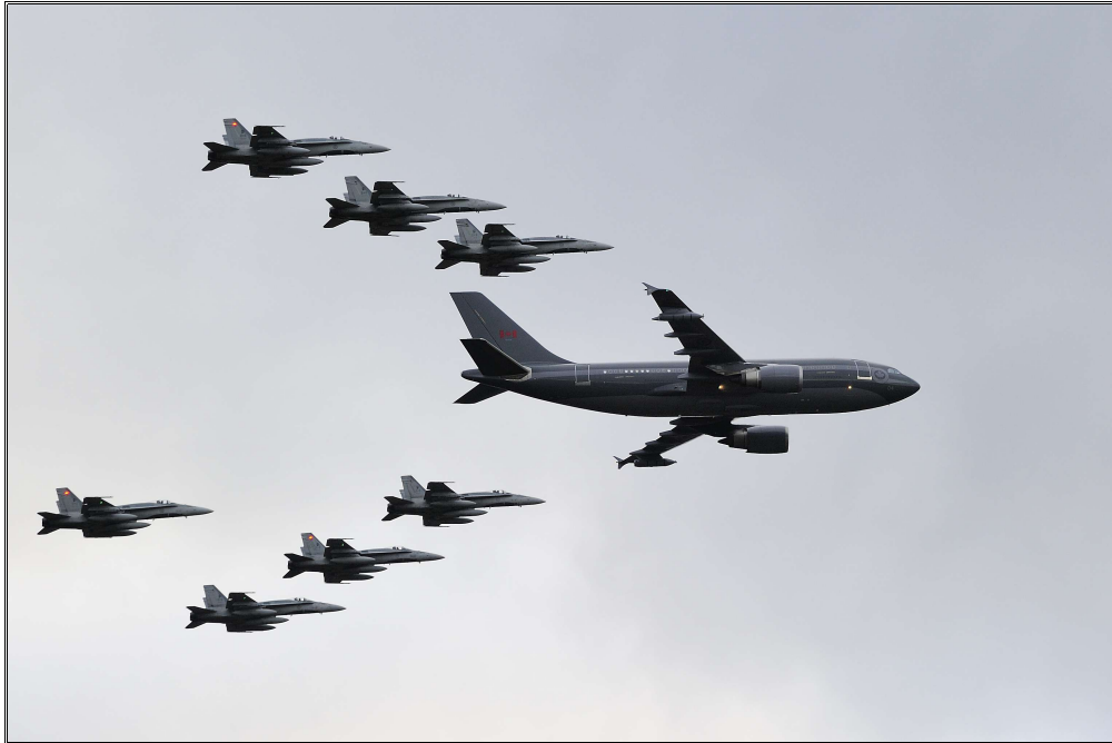
Returning from Trapani, Italy, 7 CF-188 Hornet fighters and a CC-150 Polaris Refueler fly in formation before landing at CFB Bagotville, Quebec, on Nov. 4, 2011