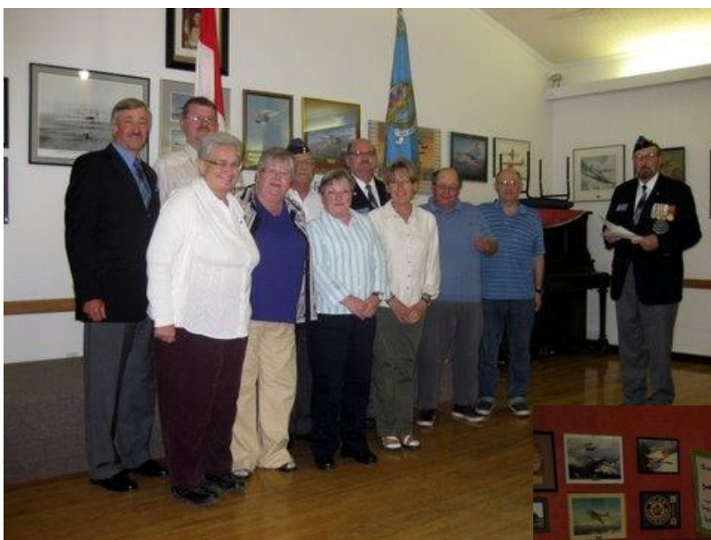
Here's a look at #702 Wing's newly Elected Executive and Directors.