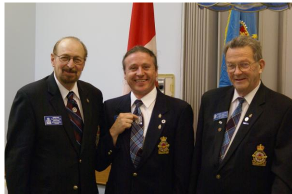
Wing of Year Calgary (#783 Wing)