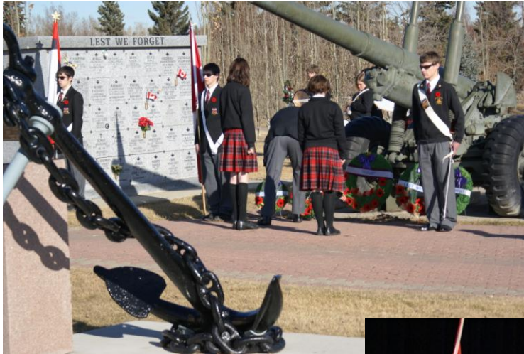
Day before Remembrance Day, Juno Beach Academy Ceremonies at Queen's Park Cemetery.