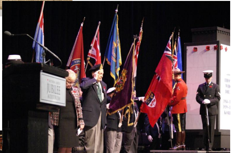
Remembrance Day Ceremonies at Jubilee Auditorium.