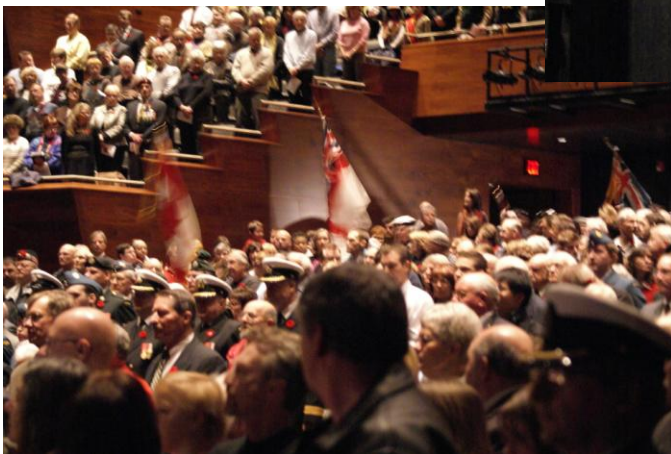
A great turnout!