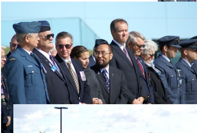
Some of the invited dignitaries, including a few of the RAF at the far right of the picture. Nice to see them represented this year.