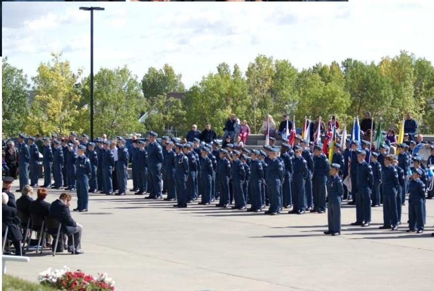
As always, the cadets look wonderful and did an outstanding job!